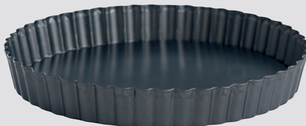
72333 PIE FORM Ø25CM CTN 12

Sweet or savoury - a good pie can turn around the most difficult of days. Our pie form is the perfect size - enjoy it alone or share with a loved one.