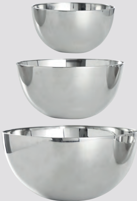
74063 BOWL SET 3PCS