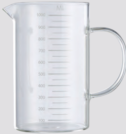
82200 MEASURING JAR 1L