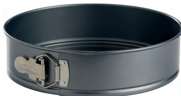
72339 SPRINGFORM Ø26CM