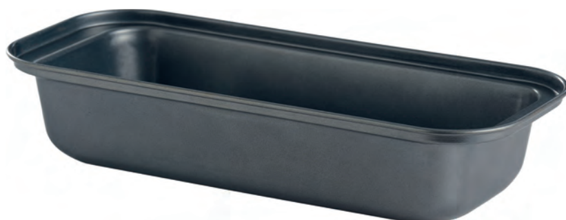
72331 LOAF PAN 31X11.5CM