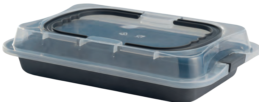
72334 ROASTING PAN 36X23CM W/LID