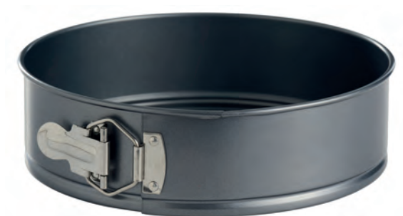
72337 SPRINGFORM Ø24CM