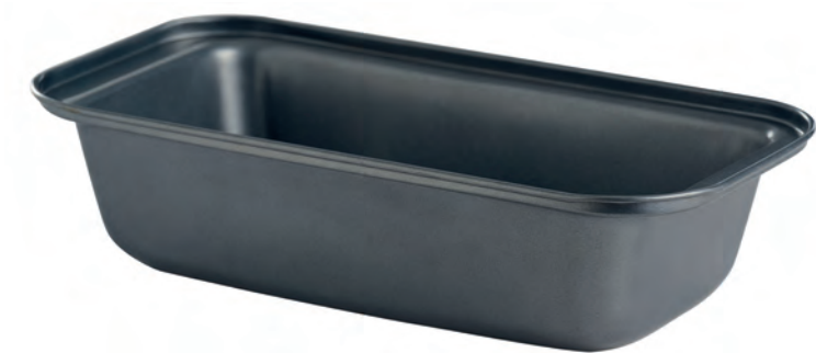
72330 LOAF PAN 25.5X12X6CM