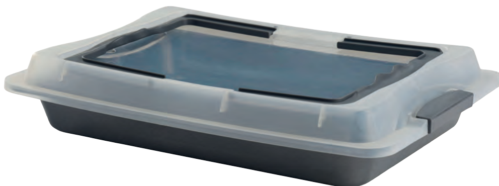
72336 ROASTING PAN 42X29CM W/LID